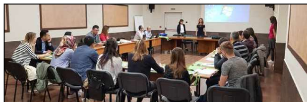
Project partners and mobility participants